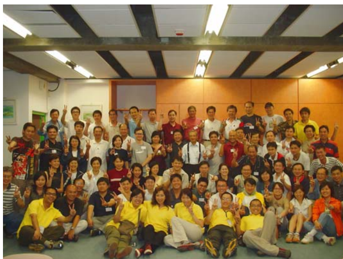
Figure 6 - Big Boss Visit