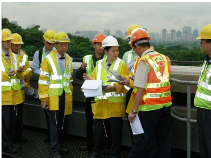
Figure 1 - Incident Handling