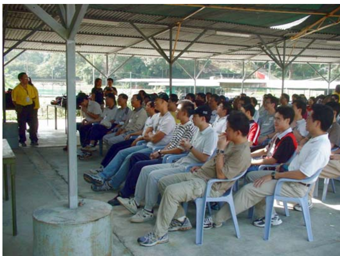
Figure 1 - Outdoor Briefing