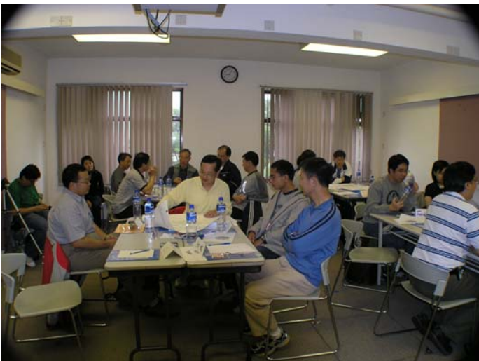
Figure 3 - Group Discussion