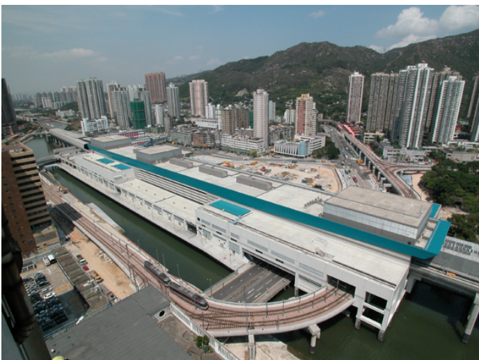
Figure 5 - West Rail/Light Rail Interchange