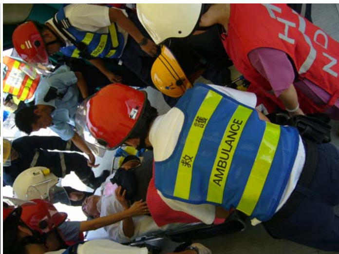
Figure 2 - Search & Rescue