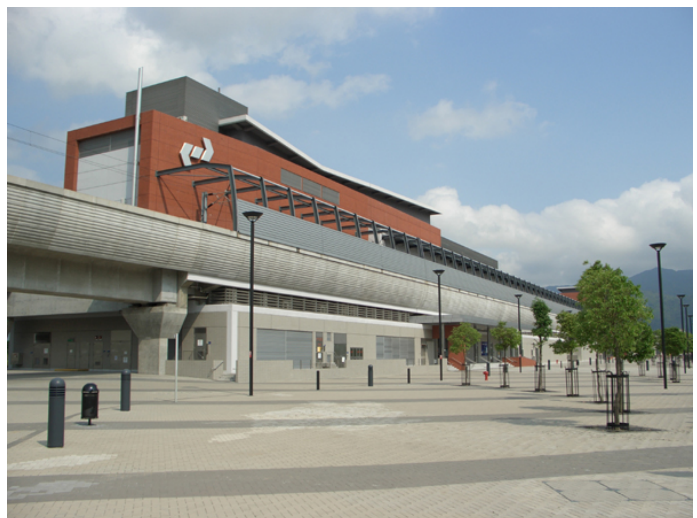
Figure 6 - West Rail Station