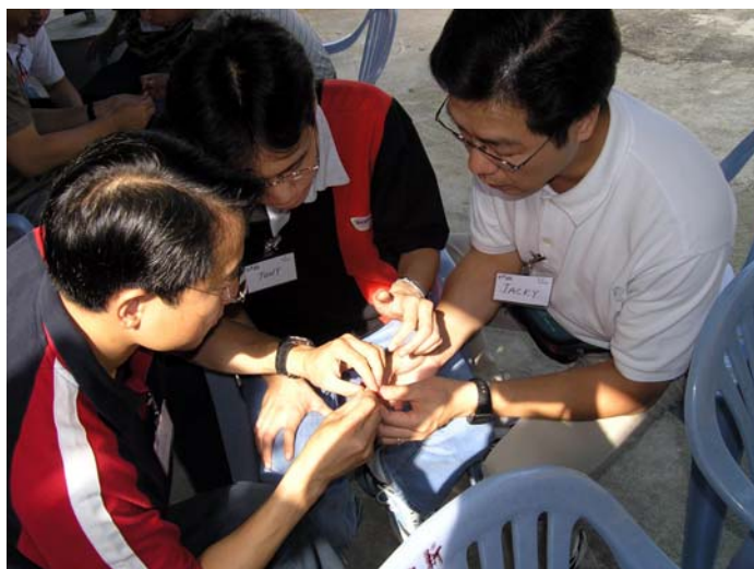
Figure 2 - Problem Solving