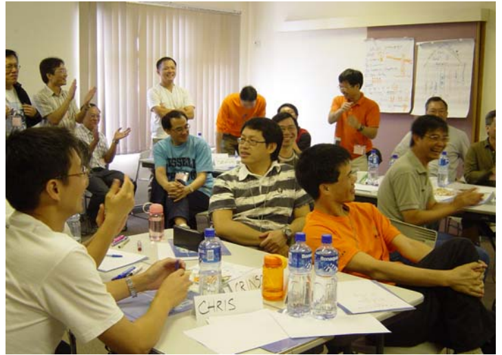
Figure 2 - Course Introduction