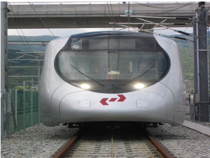
Figure 3 – West Rail Train_2