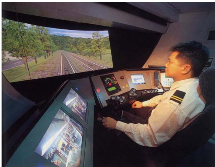
Figure 3 - Cab Simulator Interior View