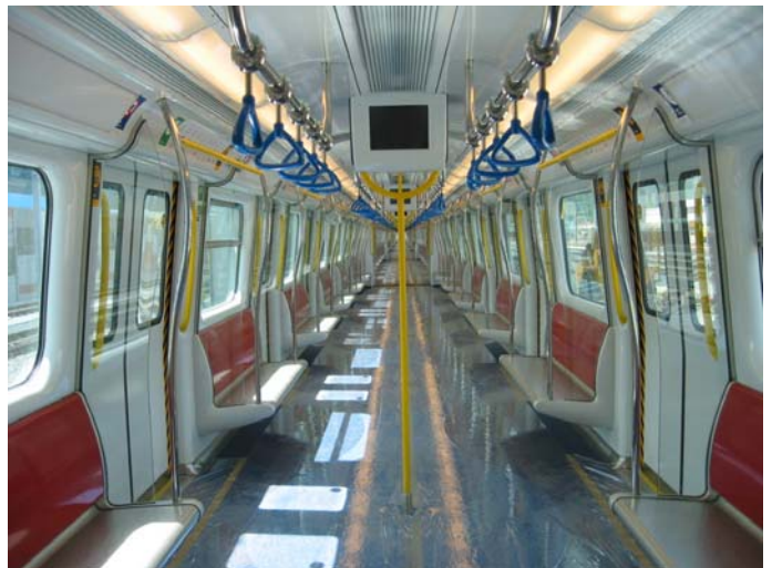
Figure 4 - West Rail Train Interior