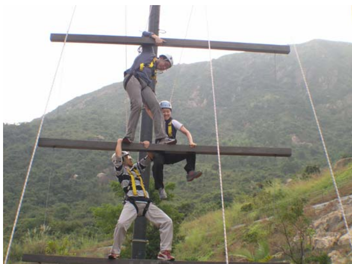
Figure 4 - Wood Climb 1