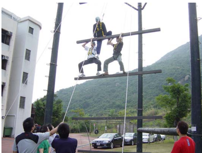
Figure 5 - Wood Climb 2