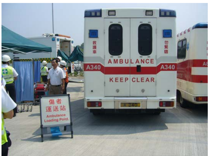
Figure 5 - Ambulance