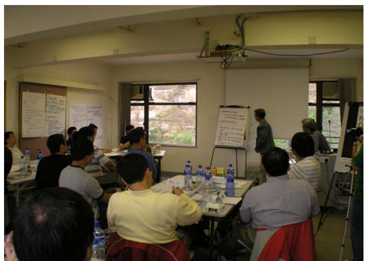
Figure 4 - Group Presentation 3