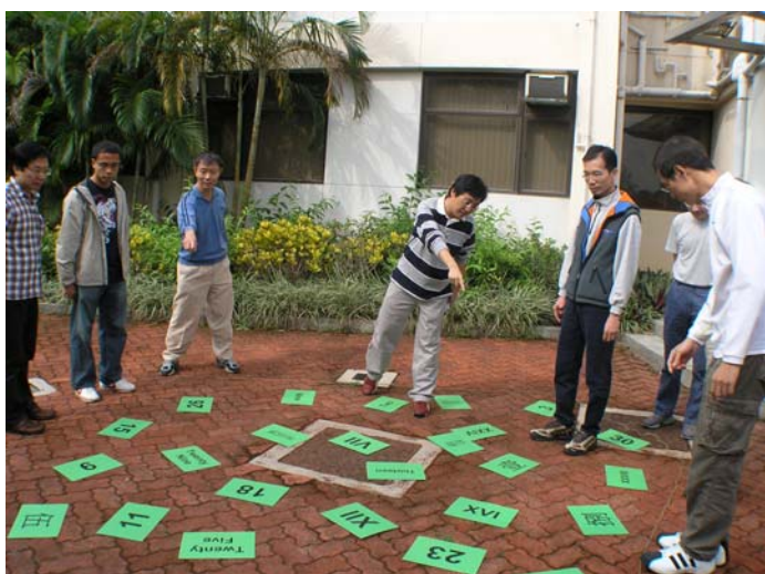
Figure 3 - Outdoor Game