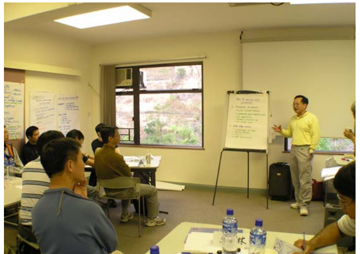
Figure 4 - Group Presentation 1