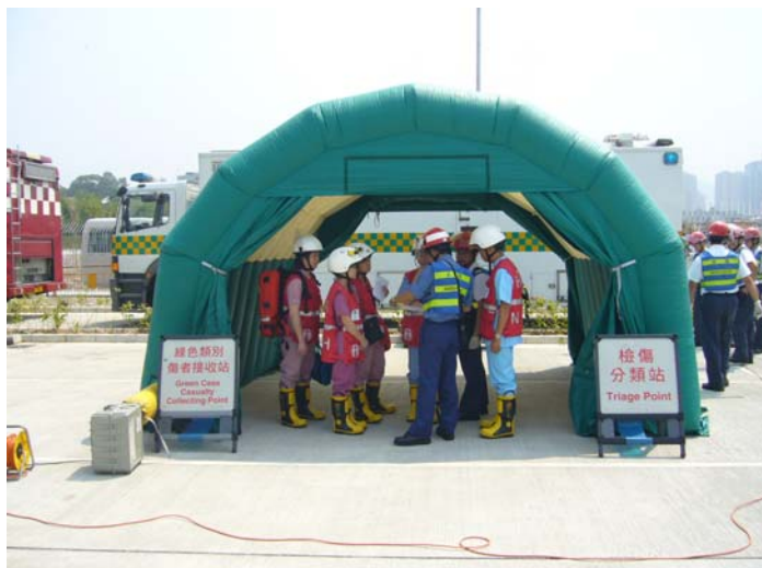
Figure 4 - Triage Point