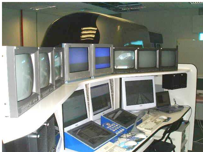
Figure 4 - Cab Simulator Instructor Console