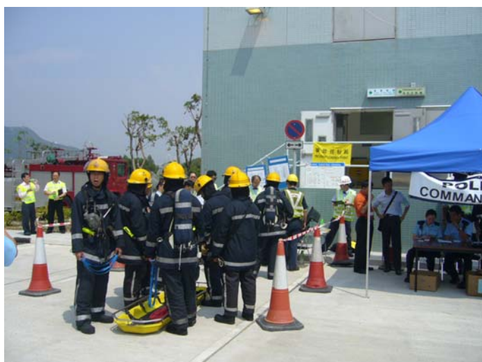
Figure 6 - Police & Fire Services