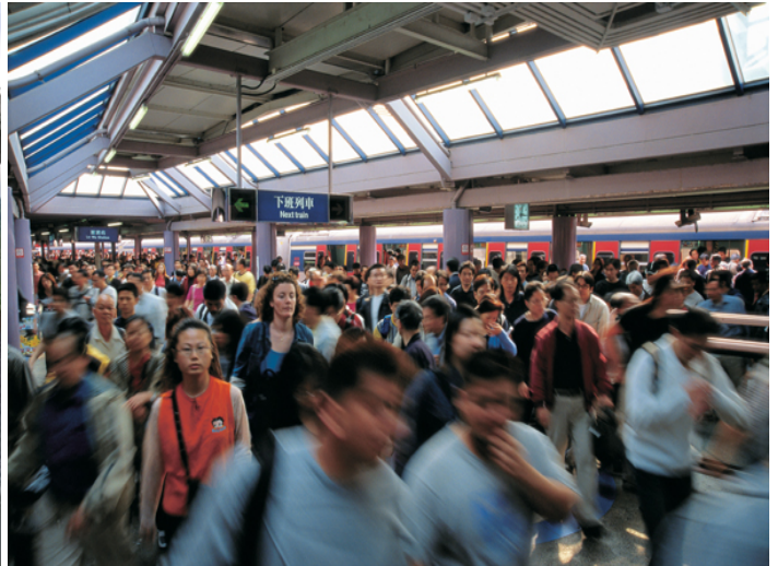
Figure 2 - Peak Hour