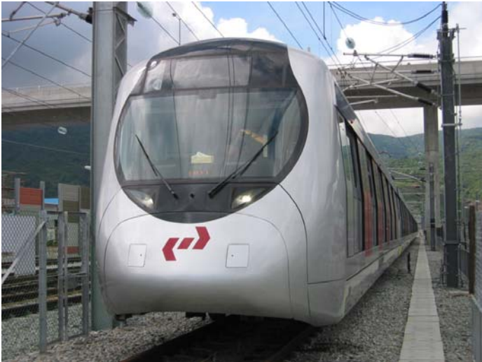
Figure 1 - West Rail Train_1