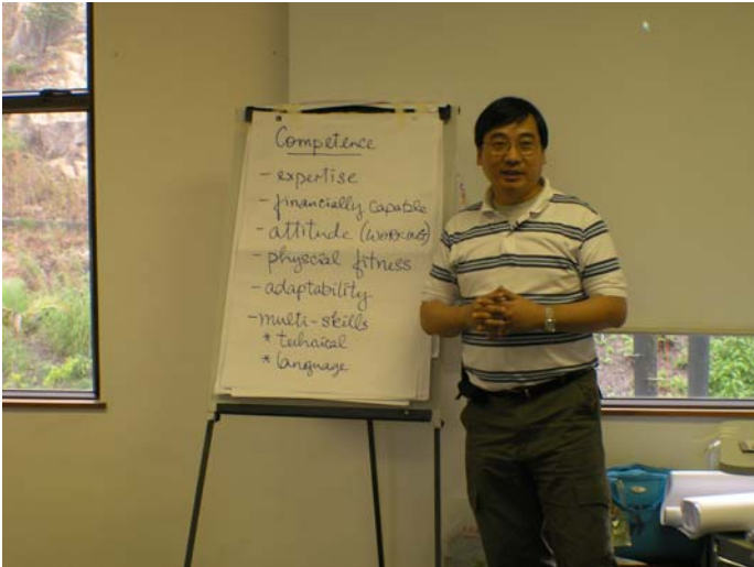
Figure 1 - Author