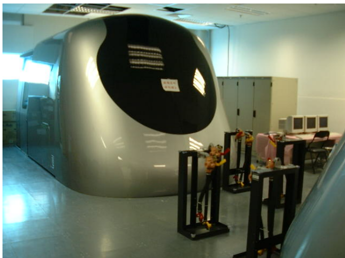
Figure 1 - Cab Simulator (two dimensional)