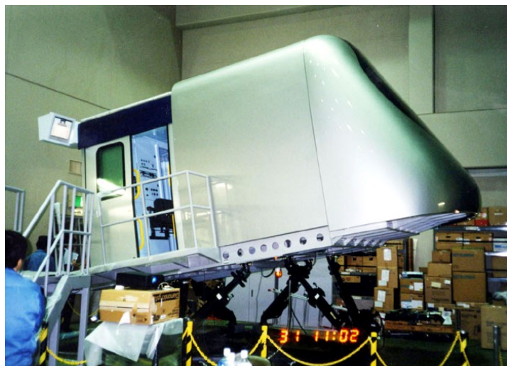
Figure 2 - Cab Simulator (3 dimensional)