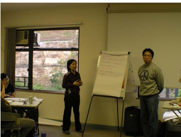
Figure 4 - Group Presentation 2