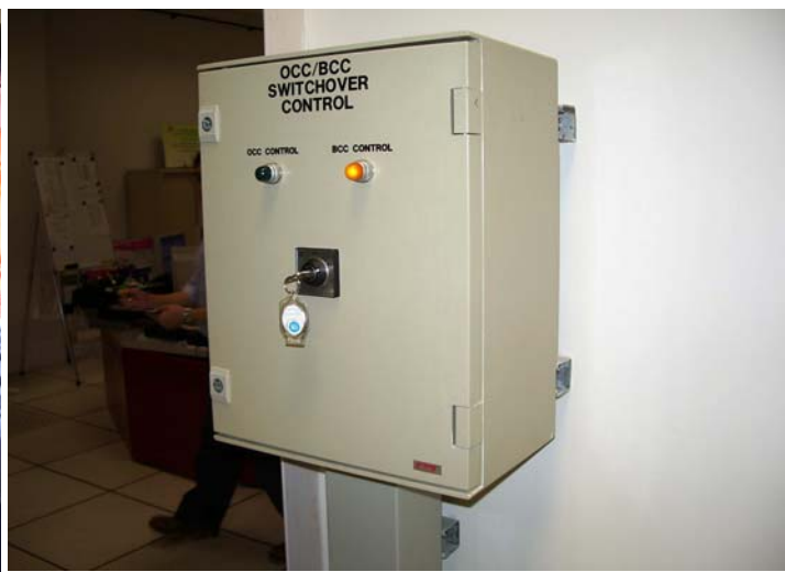
Figure 6 - OCC/BCC Switchover Control