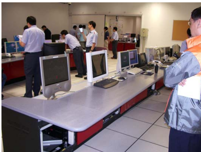
Figure 5 - OCC/BCC Changeover